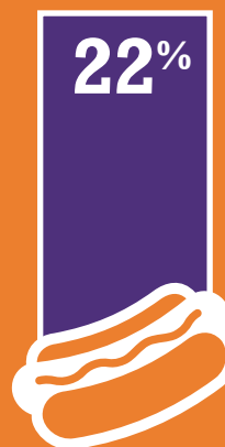
Hot dogs or sausages