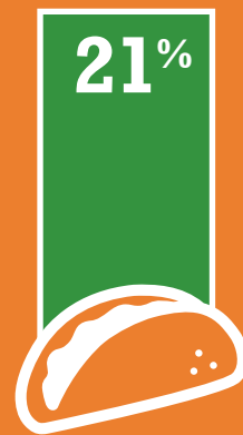
Mexican-style fare (tacos, burritos, etc.)