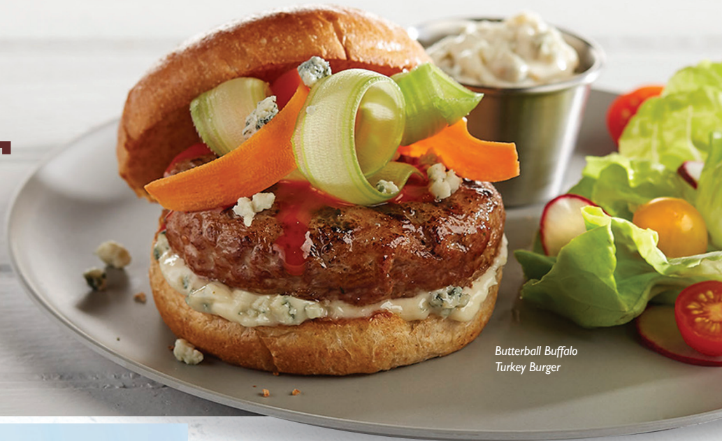
Butterball Buffalo Turkey Burger

By turning to turkey, operators can keep costs in check while delivering a delicious and wallet-friendly alternative.