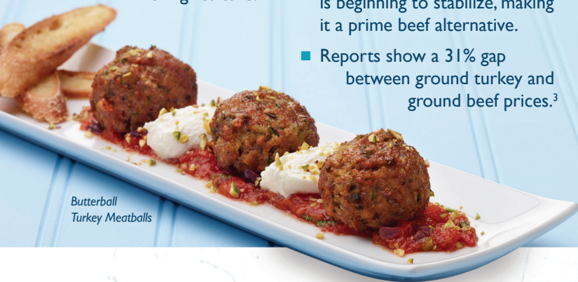
Butterball Turkey Meatballs