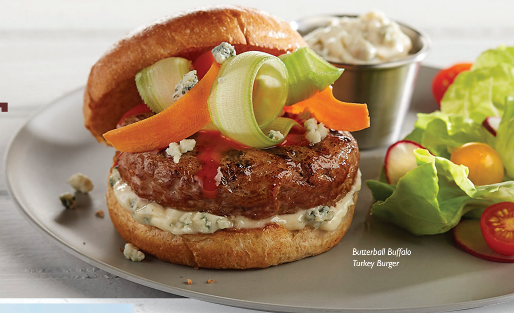
Butterball Buffalo Turkey Burger

By turning to turkey, operators can keep costs in check while delivering a delicious and wallet-friendly alternative.