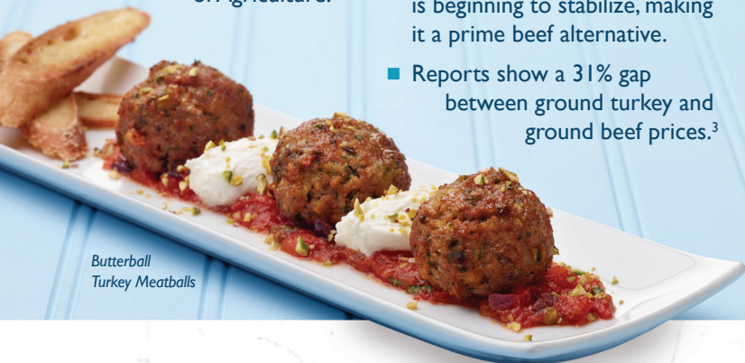
Butterball Turkey Meatballs